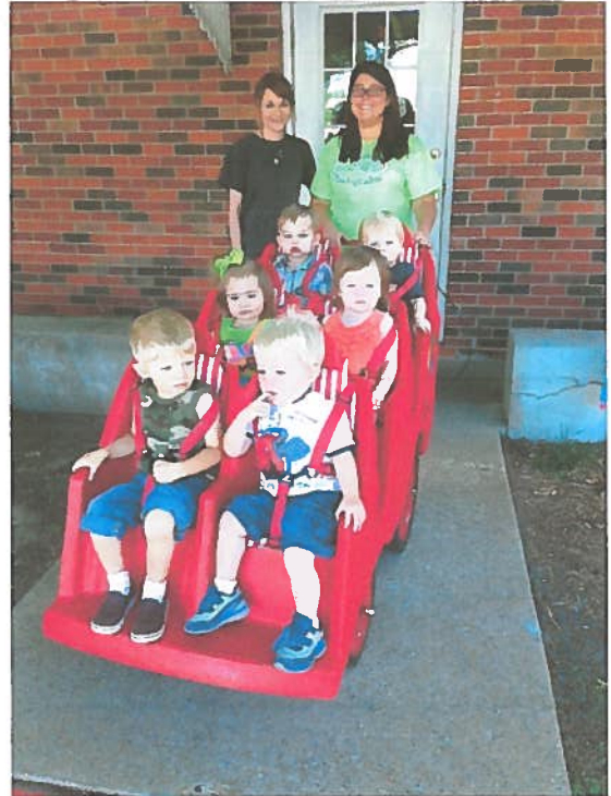
Ready for a field trip? All aboard!