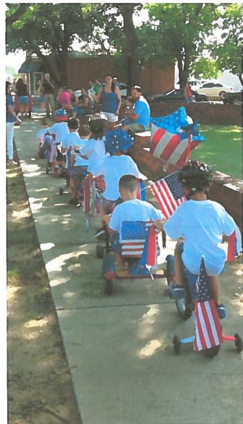
The July 4 th Celebration