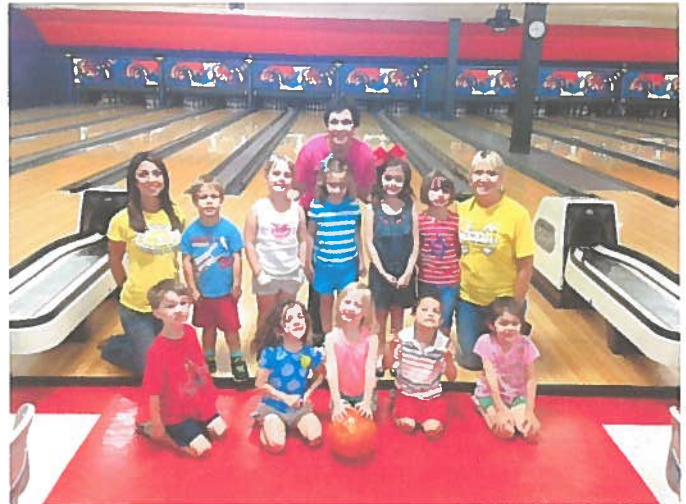
The bowling trip!