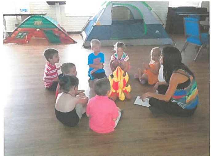
Fellowship Hall "camping!"