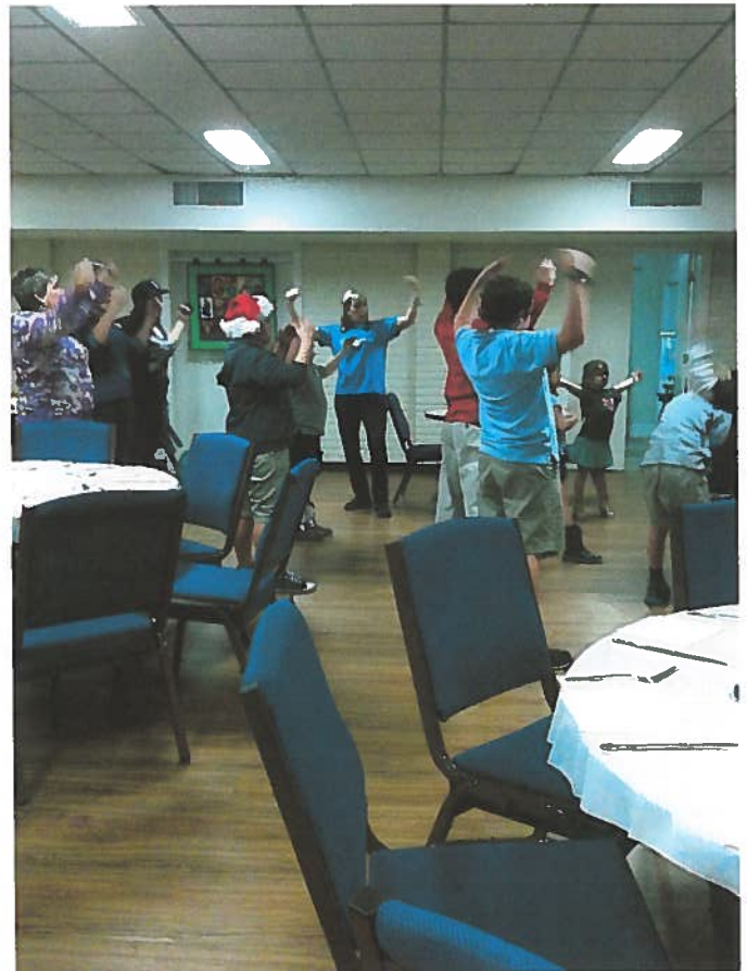
Logos Christmas Celebration Energizers, 11-28-2012