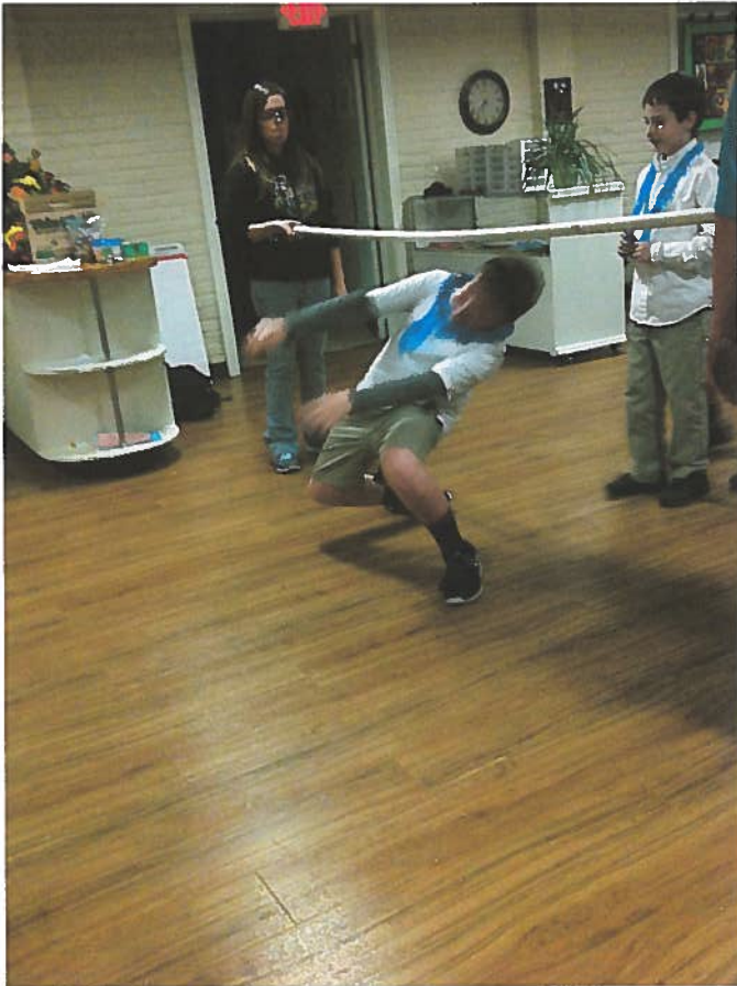
LOGOS Beach Night, February 20, 2013