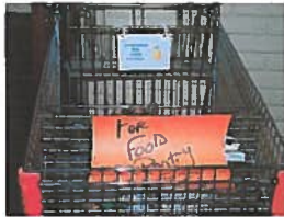
Remember the Food Pantry

Donations to the Food Pantry are always needed and deeply appreciated. Remember that non-perishable items are collected in the grocery cart in Fellowship Hall and taken to the pantry on a weekly basis or as needed.