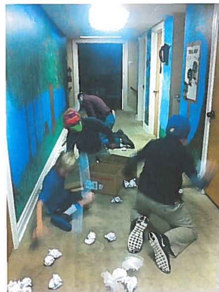
Logos Winter Wonderland Snowball Fight, 1-9-2013